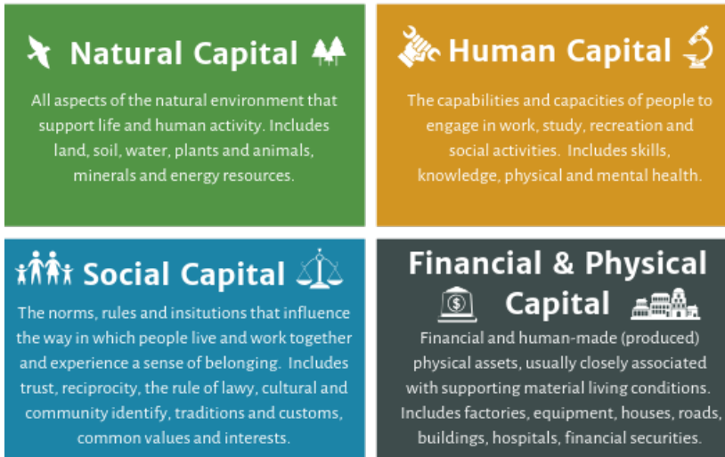
Figure 6. Treasury's Living Standards Framework

The Four Capitals of Treasury's Living Standards Framework are the assets that generate wellbeing now and into the future.