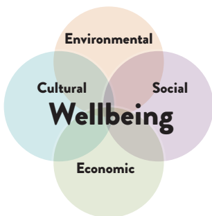
Figure 1. The four wellbeings – Local authorities play the central role in promoting the social, economic, environmental and cultural wellbeing of communities, also considered to be the pillars of sustainability