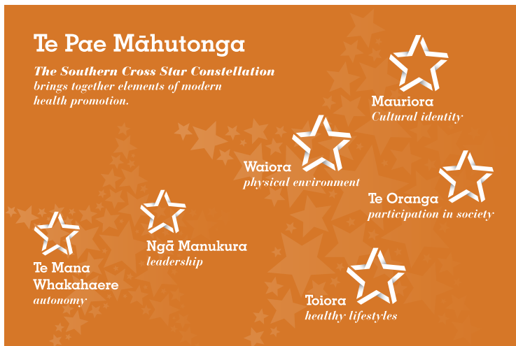
Figure 3. Te Pae Māhutonga brings together elements of modern health promotion

Tools to Support a Health in All Policies Approach gives further information on Te Pae Māhutonga and other Māori models of health. (See the References and Resources section.)