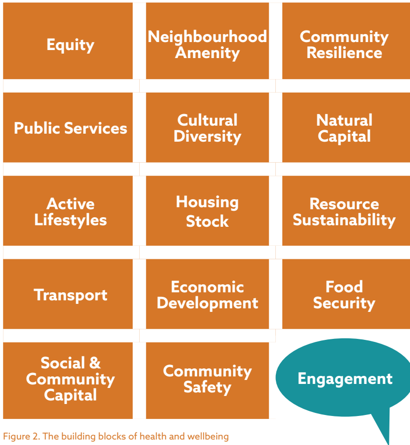
Figure 2. The building blocks of health and wellbeing