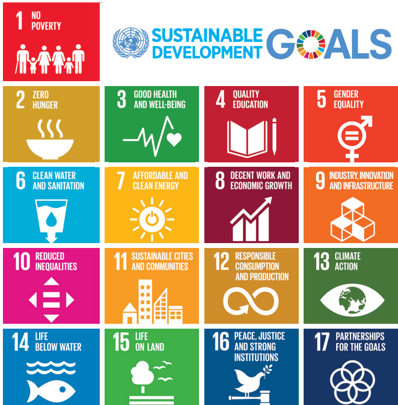
Figure 5. The 17 Sustainable Development Goals of the United Nations' 2030 Agenda for Sustainable Development

The Sustainable Development Goals (SDGs) are a collection of 17 interrelated goals set by the United Nations to end poverty, protect the planet and ensure prosperity for all. As a global, national and local social contract, in which communication, participation and partnership are key, the SDGs demand fresh attention to governance where multi-stakeholder and multi-dimensional approaches and collaboration are the norm. Almost all the SDGs are directly related to health and wellbeing or will indirectly contribute to improving health.